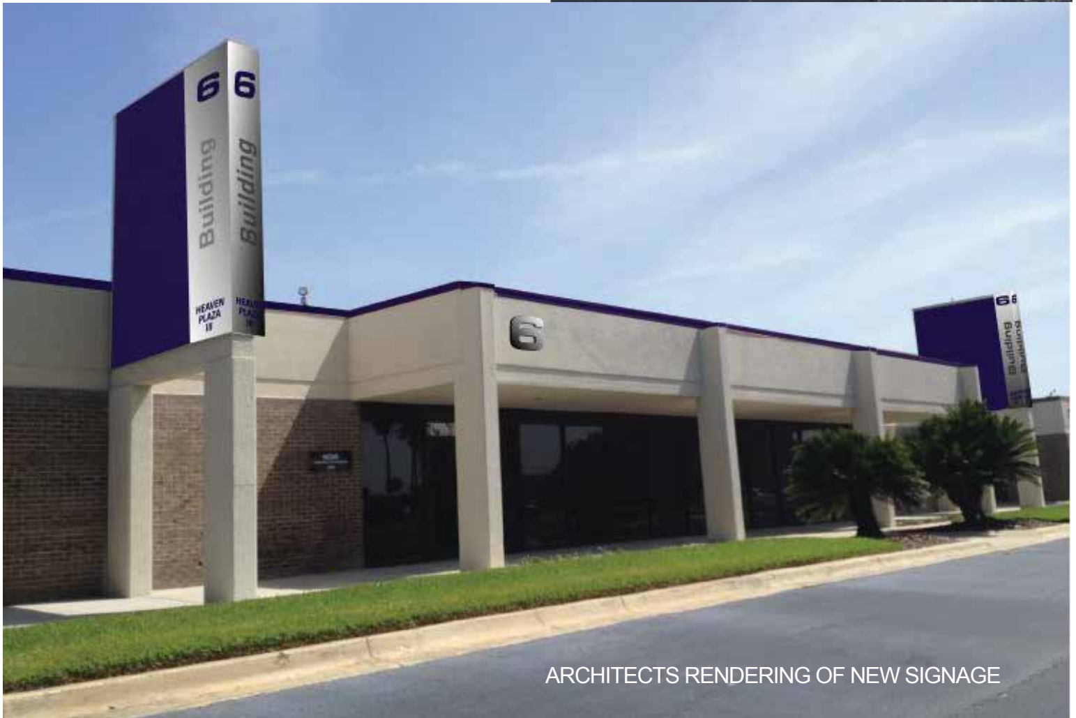
ARCHITECTS RENDERING OF NEW SIGNAGE