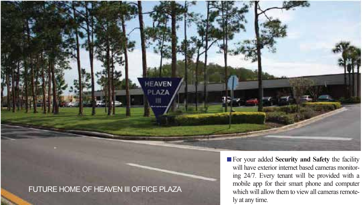
FUTURE HOME OF HEAVEN III OFFICE PLAZA

Lake Ellenor Drive, Orlando, Florida 32809